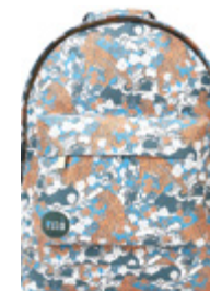
ORIENTAL TIGERS BLUE / MULTI NEW 740360-049