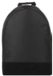
CLASSIC ALL BLACK 740860-001