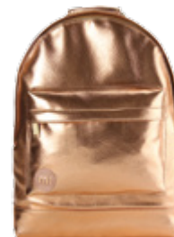
METALLIC ROSE GOLD 740360-011