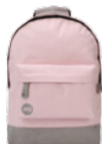
CLASSIC BLUSH / GREY NEW 740400-A03