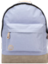
CLASSIC CORNFLOWER BLUE / GREY 740001-A15