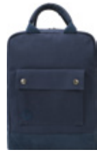
CANVAS NAVY NEW 742910-002