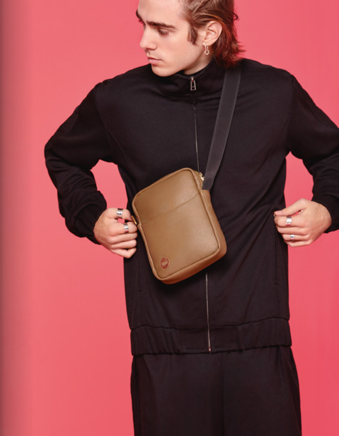
TUMBLER KHAKI FLIGHT BAG 57