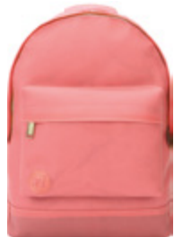
RUBBER CORAL NEW 740360-045