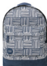
SCRIBBLE CHECK NAVY NEW 740215-104