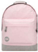
CLASSIC BLUSH / GREY NEW 740001-A17