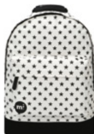
ALL STARS MONOCHROME NEW 740321-A06