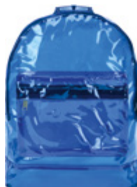
TRANSPARENT BLUE NEW 740215-131