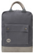
CANVAS CHARCOAL NEW 742910-006