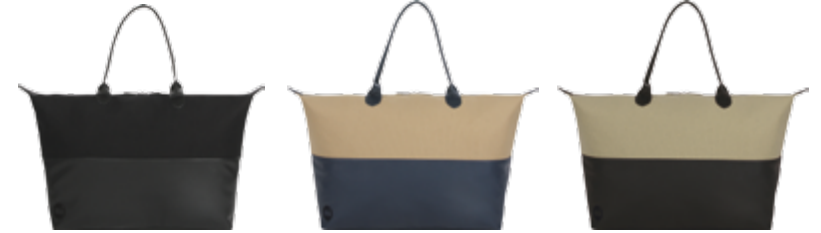
50/50 CANVAS TUMBLED BLACK 742350-027