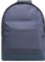
CLASSIC ALL NAVY 740001-A07