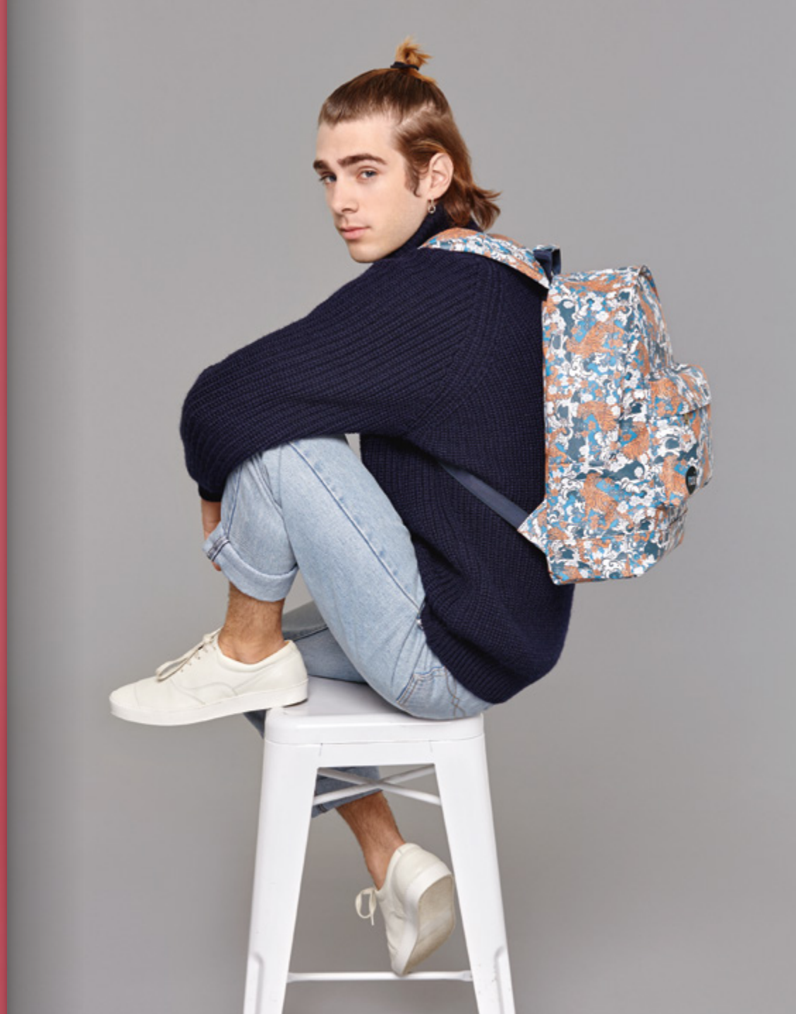
ORIENTAL TIGERS BLUE / MULTI BACKPACK 59