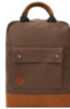
CANVAS DARK BROWN NEW 742910-005