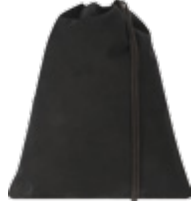
CANVAS BLACK 740554-011