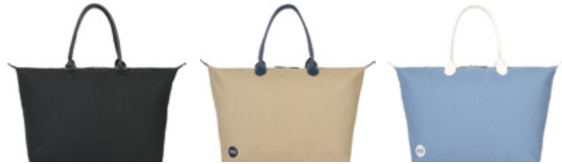
CANVAS BLACK NEW 742350-034