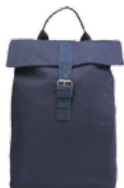
CANVAS NAVY 740530-002