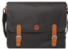
CLASSIC BLACK 740470-001