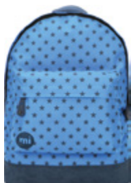
ALL STARS ROYAL NAVY NEW 740321-A05