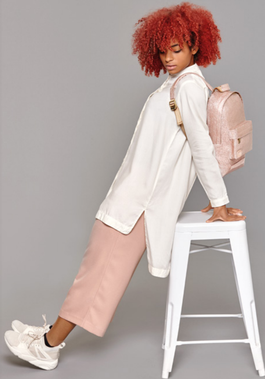
GLITTER CHAMPAGNE MINI BACKPACK 51