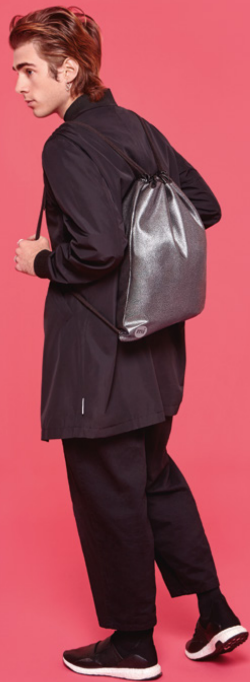
PEBBLED SILVER / BLACK KIT BAG 65