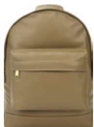
TUMBLED KHAKI NEW 740349-012