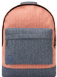
HERRINGBONE MIX TERRACOTTA / NAVY NEW 740338-042