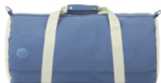
CANVAS BLUE / CREAM 740614-382