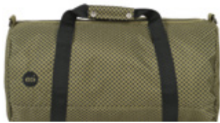
MICRODOT KHAKI / BLACK NEW 740607-132