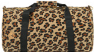
LEOPARD PONY TAN NEW 740620-053