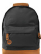
CLASSIC BLACK 740400-001