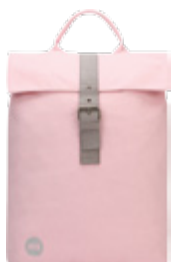
CANVAS PINK 740530-007