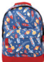
SPACE BLUE NEW 740416-035