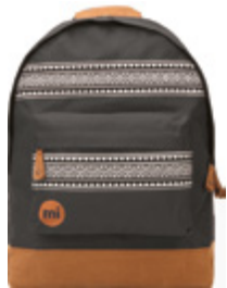
NORDIC BLACK 740101-001