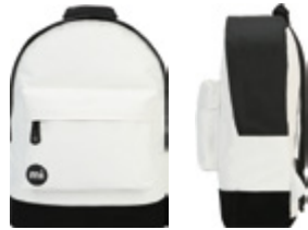
CLASSIC MONOCHROME NEW 740001-A20