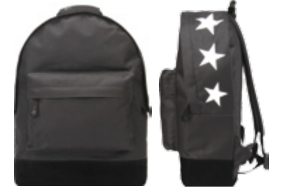
TOPSTARS BLACK 740319-100