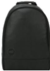
TUMBLED BLACK NEW 742750-001