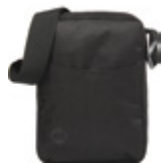
CLASSIC ALL BLACK 742500-001