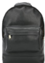
TUMBLED BLACK NEW 740416-041