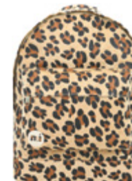
LEOPARD PONY TAN NEW 740360-054