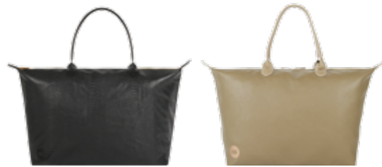
PYTHON BLACK 742350-005