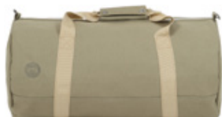
CANVAS KHAKE NEW 740614-A19