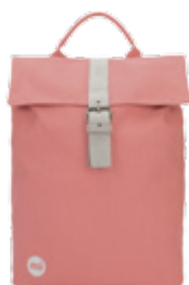
CANVAS ROSE NEW 740530-013