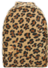
LEOPARD PONY TAN NEW 742750-002