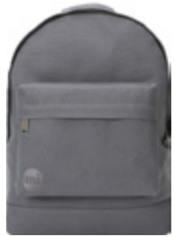
CANVAS CHARCOAL NEW 740314-057