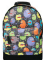
MONSTERS BLACK NEW 740416-036