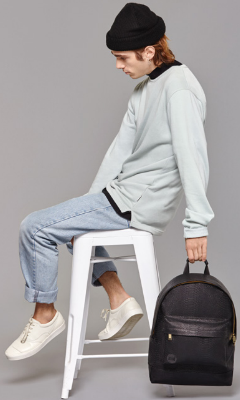
PYTHON BLACK BACKPACK 55