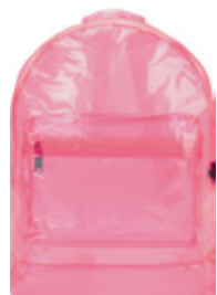
TRANSPARENT PINK NEW 740215-130