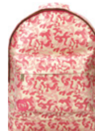
METALLIC CAMO GOLD / PINK NEW 740360-055