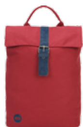
CANVAS BURGUNDY NEW 740530-014