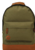
CLASSIC KHAKE NEW 740400-A04