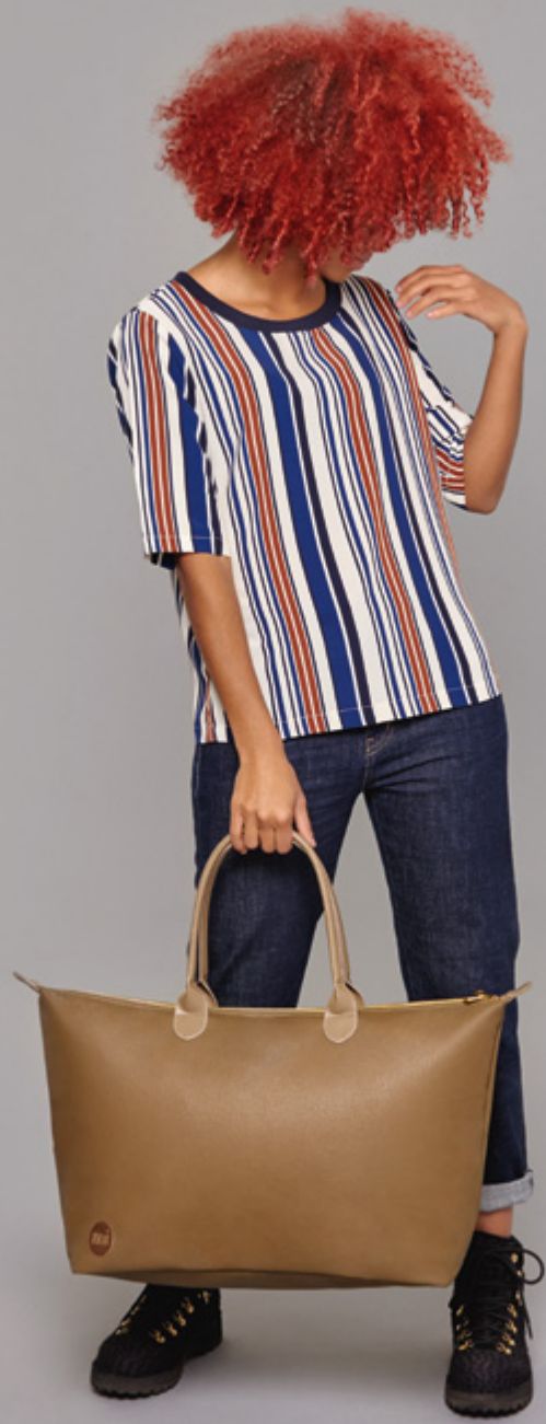
TUMBLED KHAHI WEEKENDER 60