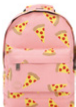
PIZZA PINK NEW 740416-038