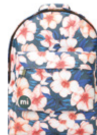
MIDNIGHT GARDEN NAVY / MULTI NEW 740360-048