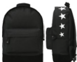
TOP STARS BLACK NEW 740410-A50