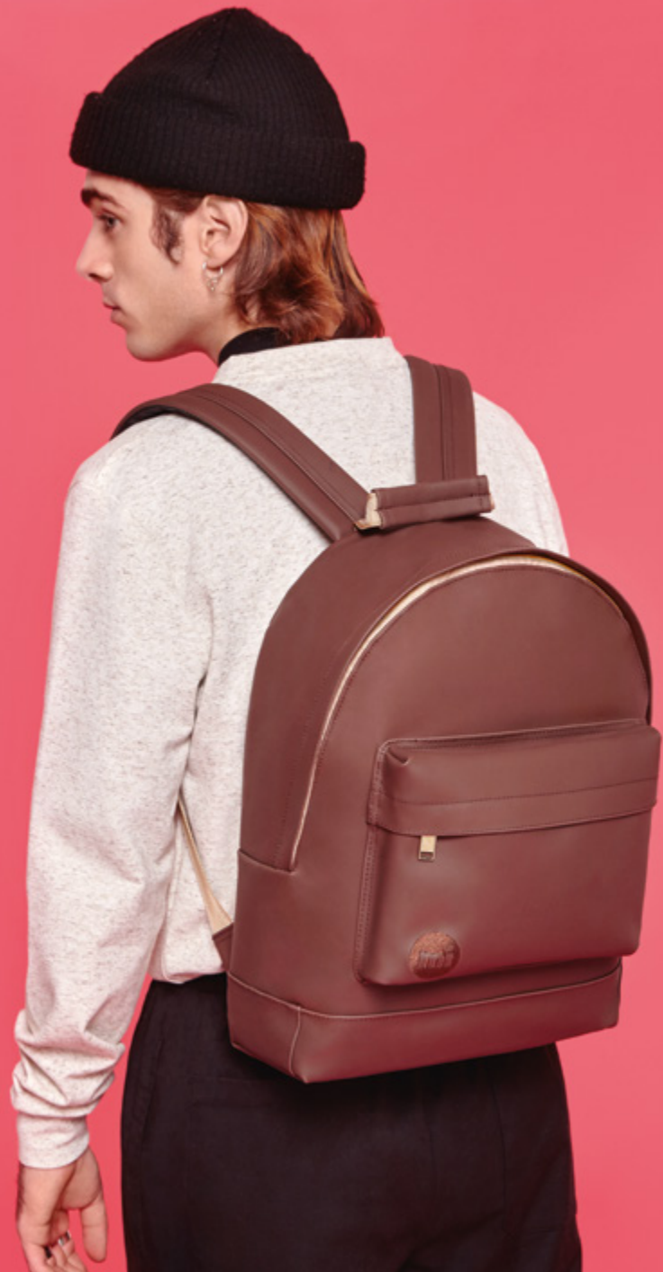
RUBBER BROWN BACKPACK 50