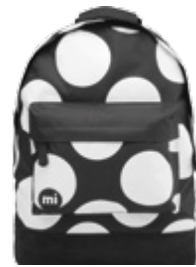
POLKA XL BLACK / WHITE 740198-003