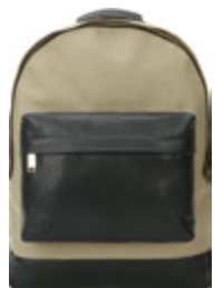
CANVAS TUMBLED KHAKI / BLACK NEW 740360-052