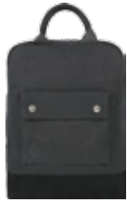
CANVAS BLACK NEW 742910-001