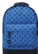
ALL STARS ROYAL / NAVY NEW 740410-A03