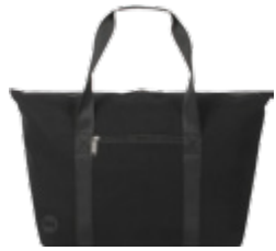
CANVAS BLACK 740840-001