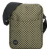
MICRODOT KHAKI / BLACK NEW 742510-011