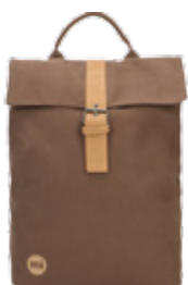
CANVAS DARK BROWN NEW 740530-012