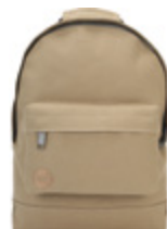
CANVAS SAND NEW 740416-040