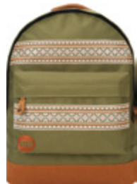
NORDIC KHAKE NEW 740101-A05