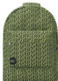
KNIT YELLOW / BLACK NEW 740314-086