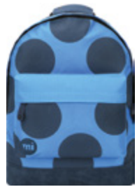
POLKA XL ROYAL / NAVY NEW 740198-004