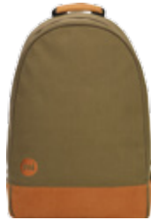
CLASSIC KHAKI NEW 740860-003