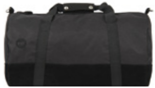
CLASSIC ALL BLACK 740601-A01