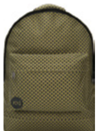
MICRODOT KHAKI / BLACK NEW 740215-122