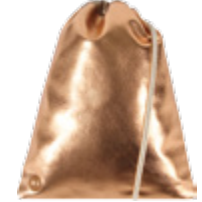
METALLIC ROSE / GOLD 740555-014