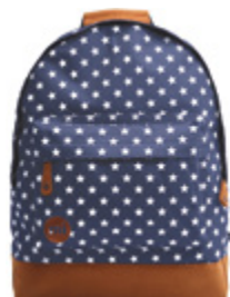
ALL STARS NAVY 740321-011