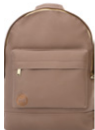
RUBBER BROWN NEW 740360-044