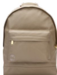
TUMBLED MUSHROOM 740349-011