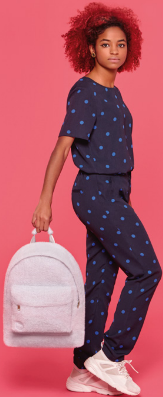
FUR LIGHT GREY BACKPACK 54