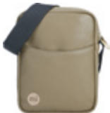
TUMBLED KHAKI NEW 742550-007