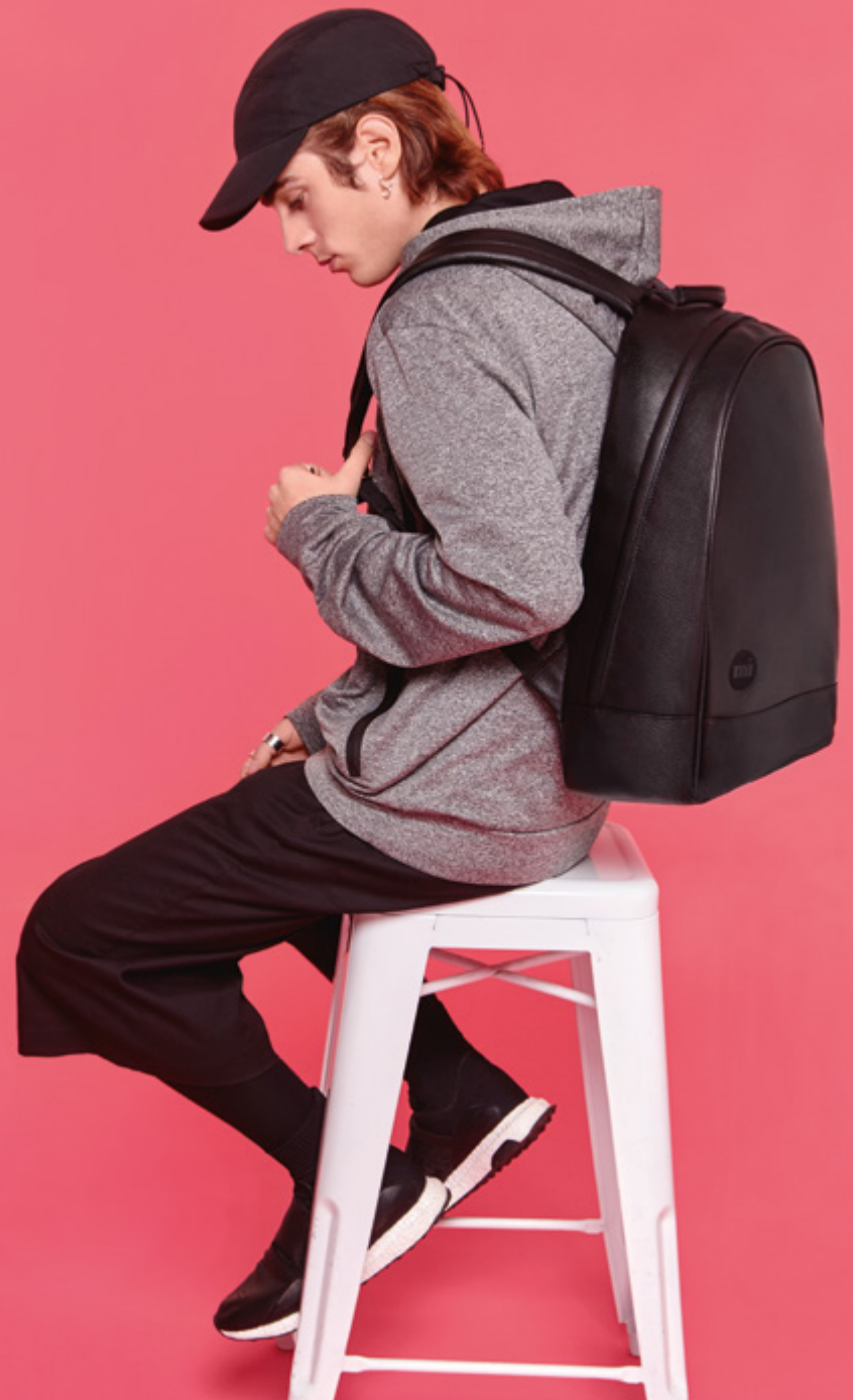
TUMBLED BLACK XL 61