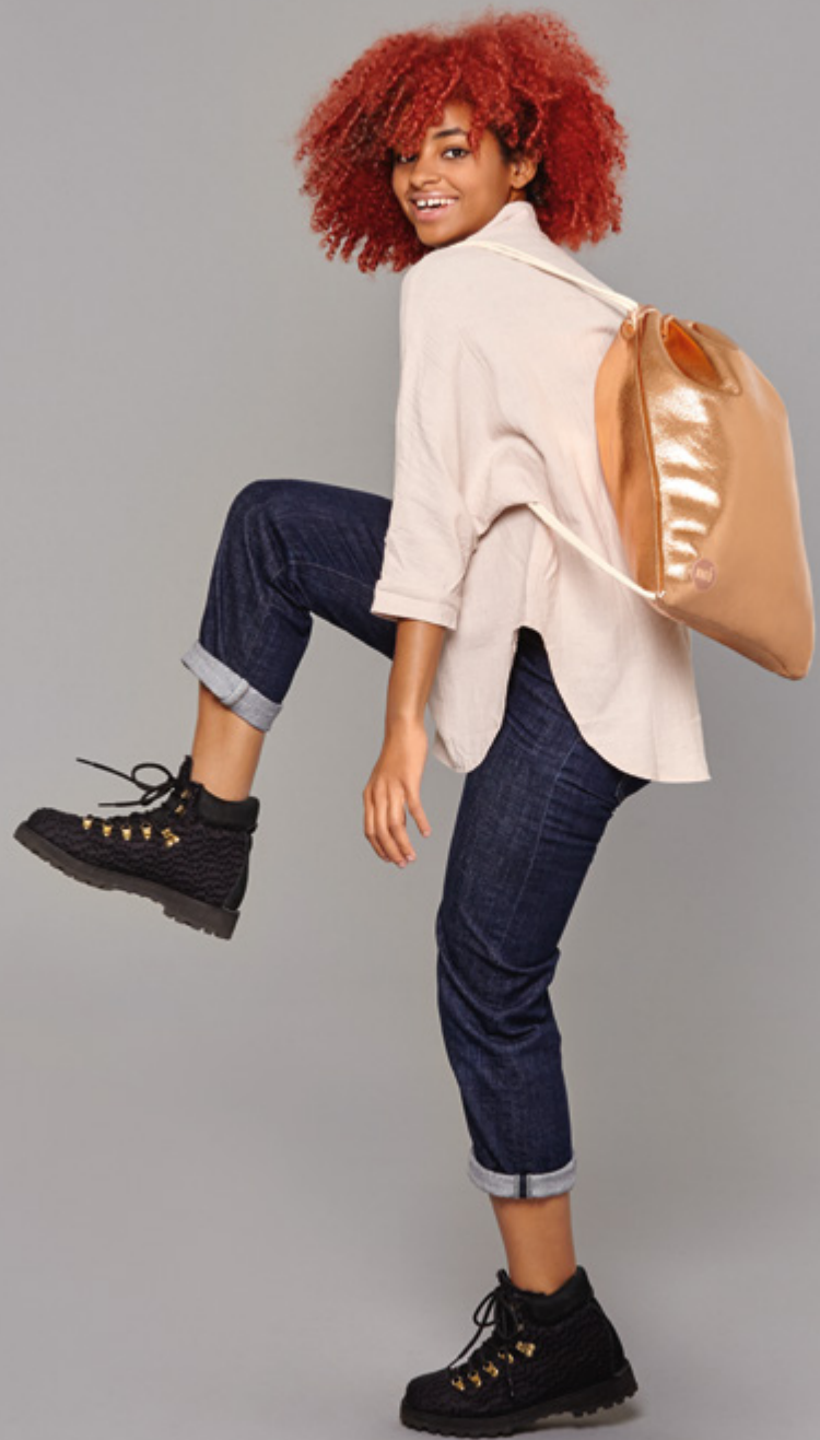
METALLIC ROSE GOLD KIT BAG 64