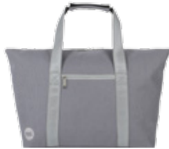
CANVAS CHARCOAL NEW 740840-004