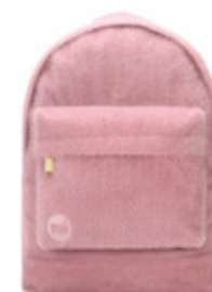
FUR MAUVE NEW 740360-075