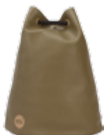
TUMBLED KHAKE NEW 740461-010