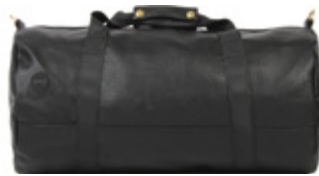
TUMBLED BLACK 740620-044