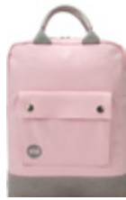
CANVAS PINK NEW 742910-003