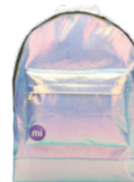
PEBBLED IRIDIUM 740360-043