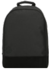
CLASSIC ALL BLACK NEW 742700-001