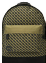
BARBED WIRE KHAKI / BLACK NEW 740215-102