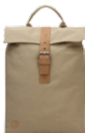
CANVAS SAND 740530-009