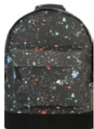
SPLATTERED MULTI NEW 740314-082