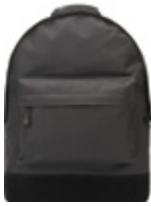
CLASSIC ALL BLACK 740001-A01