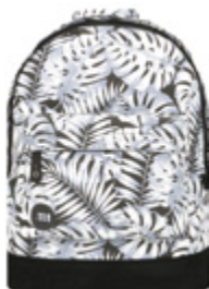
TROPICAL LEAF GREY NEW 740314-081