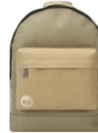
CANVAS TONAL KHAKI / SAND NEW 740314-068