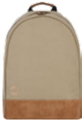
CANVAS SAND 740870-003