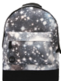
GALAXY BLACK 740218-003