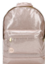
GLITTER CHAMPAGNE NEW 740416-045