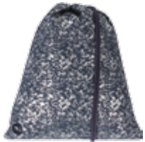
DENIM SPLATTER INDIGO / SILVER 740554-010