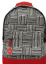
SCRIBBLE CHECK MONOCHROME / RED NEW 740416-033