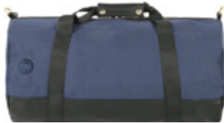
CANVAS TUMBLED NAVY BLACK NEW 740620-052