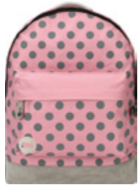
ALL POLKA ROSE / GREY NEW 740199-A06