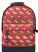
TRACTORS RED NEW 740416-034