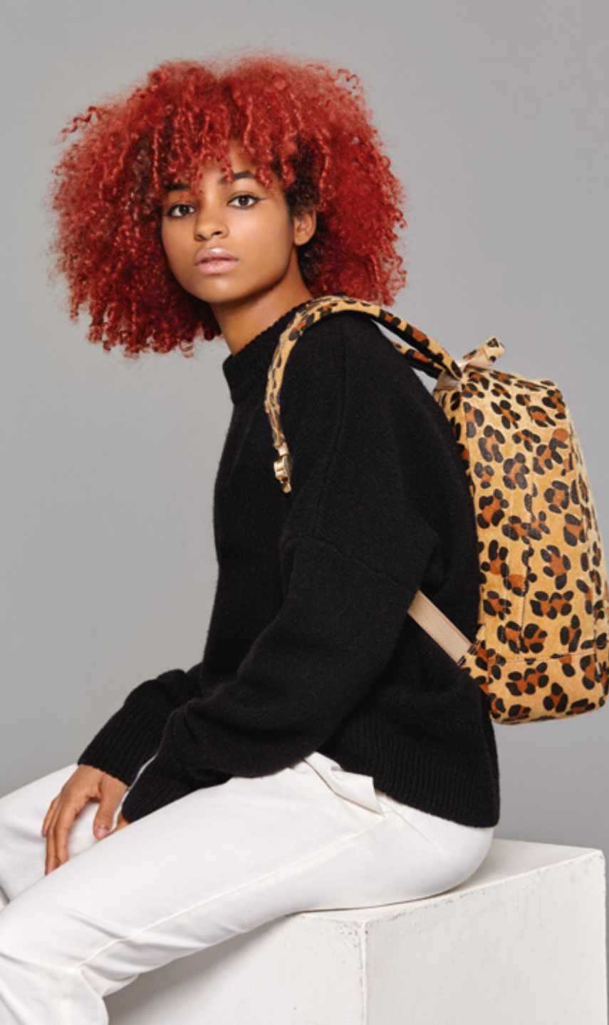
LEOPARD PONY TAN XS 56