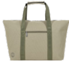
CANVAS KHAKI NEW 740840-005