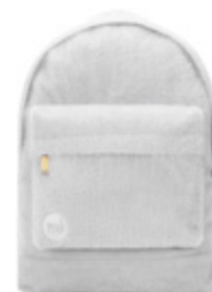
FUR LIGHT GREY NEW 740360-076