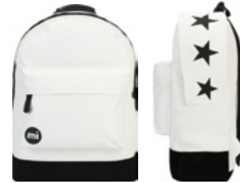
TOPSTARS MONOCHROME NEW 740319-104