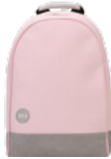
CANVAS PINK / GREY NEW 742701-001