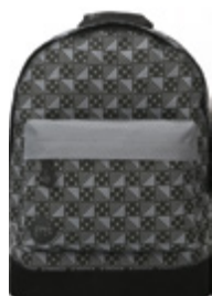
DICE CHARCOAL NEW 740215-103