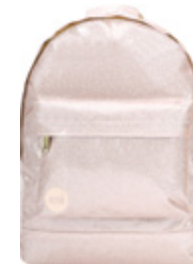
GLITTER CHAMPAGNE NEW 740360-042