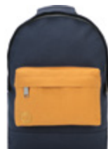
CANVAS NAVY / YELLOW NEW 740416-039