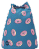
DOUGHNUT NAVY NEW 740460-013