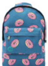
DOUGHNUT NAVY NEW 740416-037