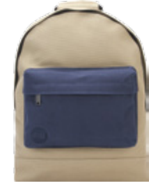
CANVAS TONAL SAND / NAVY 740314-065