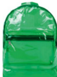
TRANSPARENT GREEN NEW 740215-132