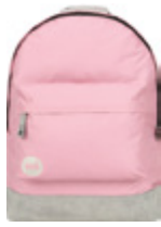
CLASSIC ROSE / GREY NEW 740001-A18