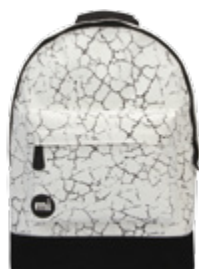
CRACKED NATURAL / BLACK 740214-102