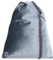
VELVET PETROL BLUE NEW 740554-014