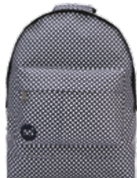
MICRODOT NAVY 740215-121