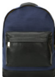
CANVAS TUMBLED NAVY / BLACK NEW 740360-053