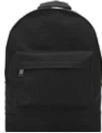
CANVAS BLACK 740314-055