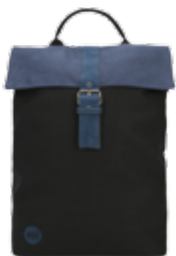
TONAL CANVAS BLACK / NAVY NEW 740530-016