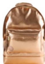
METALLIC ROSE GOLD 740426-005