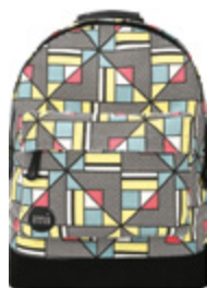
CANVAS GEOMETRIC MULTI NEW 740314-075