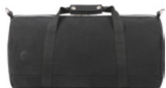
CANVAS BLACK 740614-380