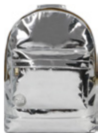
MIRROR SILVER NEW 740360-046