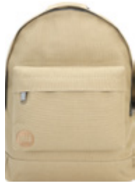
CANVAS SAND NEW 740314-058