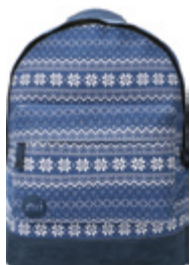
FAIRISLE BLUE NEW 740314-085