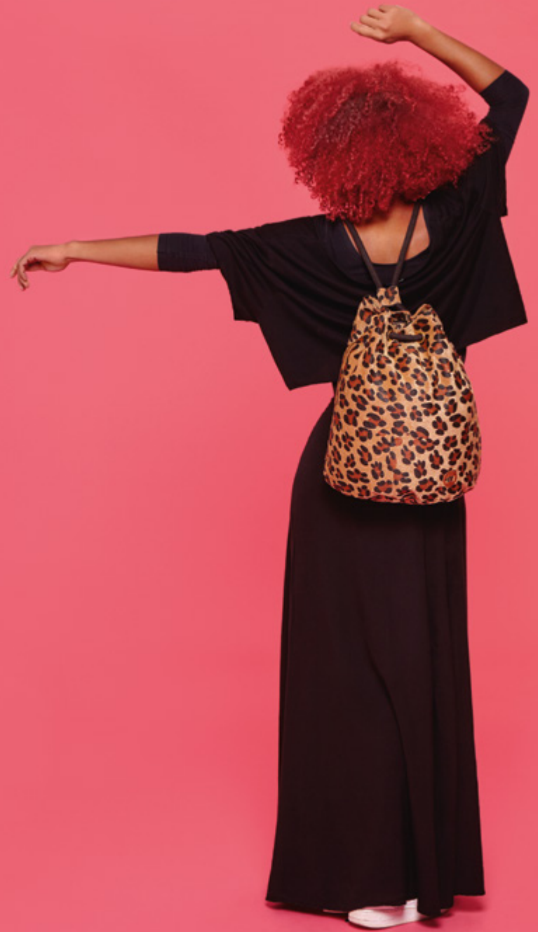
LEOPARD PONY TAN SWING BAG 53