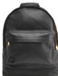
TUMBLED BLACK 740349-005