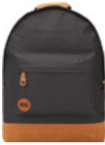
CLASSIC BLACK 740001-001