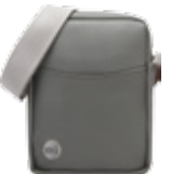
RUBBER GREY 742550-006