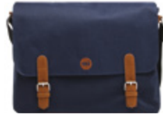
CLASSIC NAVY 740470-011