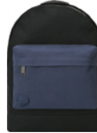
CANVAS TONAL BLACK / NAVY NEW 740314-067