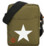
CLASSIC STAR KHAKI NEW 742501-004