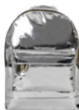
MIRROR SILVER NEW 740416-044