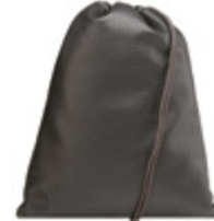
TUMBLED BLACK 740555-002