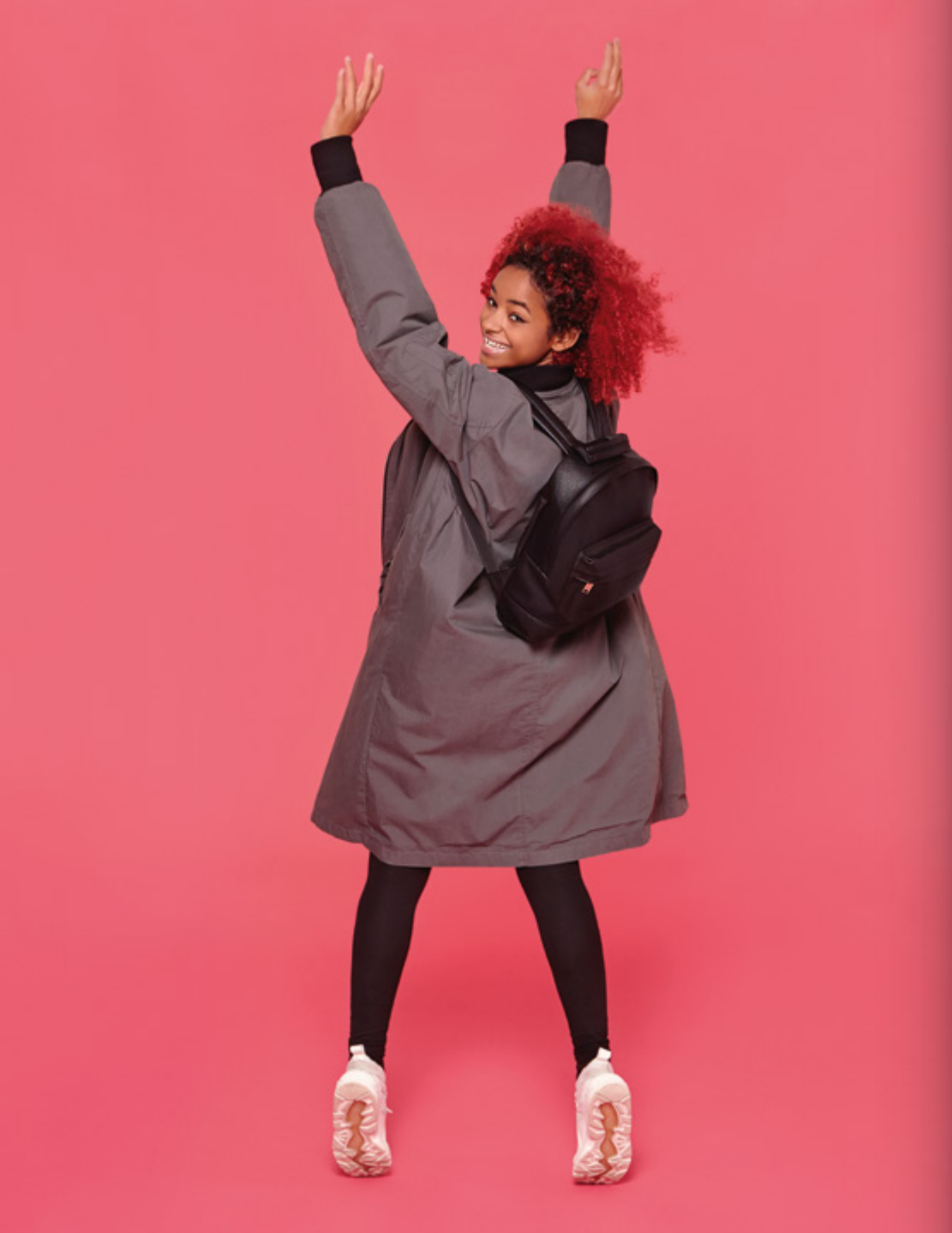
TUMBLED BLACK MINI BACKPACK 58