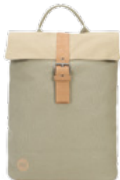
TONAL CANVAS KHAKEI / SAND NEW 740530-015