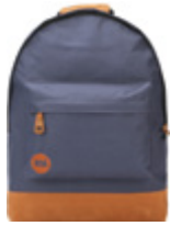
CLASSIC NAVY 740001-011