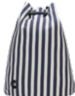
SEASIDE STRIPE BLUE 740460-008