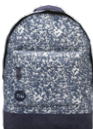
DENIM SPLATTER INDIGO / SILVER 740299-013