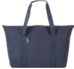
CANVAS NAVY 740840-002