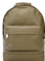
TUMBLED KHAKI NEW 740416-043