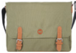
CLASSIC KHAKI NEW 740470-A01