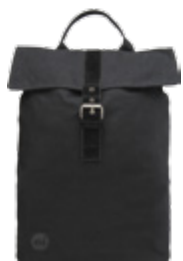
CANVAS BLACK 740530-001