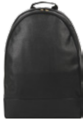
TUMBLED BLACK 740880-001