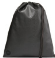
PYTHON BLACK 740555-006