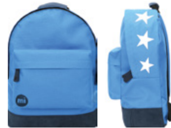
TOPSTARS ROYAL / NAVY NEW 740319-106