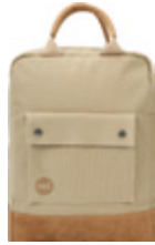
CANVAS SAND NEW 742910-004