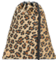
LEOPARD PONY TAN NEW 740555-018