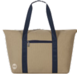
CANVAS SAND 740840-003