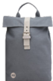
CANVAS CHARCOAL 740530-003