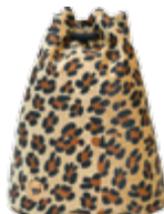
LEOPARD PONY TAN NEW 740461-011