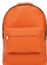
TUMBLED BURNT ORANGE NEW 740416-042