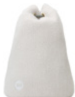
FUR LIGHT GREY NEW 740461-012