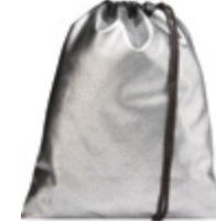
PEBBLED SILVER / BLACK 740555-005