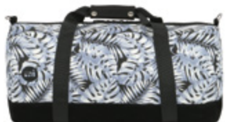
TROPICAL LEAF GREY NEW 740614-A18