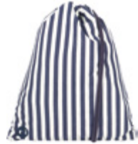
SEASIDE STRIPE BLUE NEW 740554-017