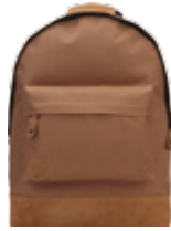
CLASSIC MOCHA 740001-A13