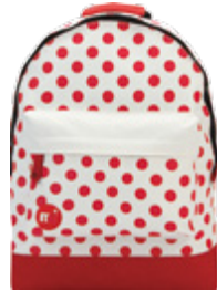
ALL POLKA NATURAL / RED 740199-A04