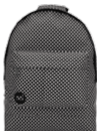
MICRODOT BLACK / GREY 740215-120