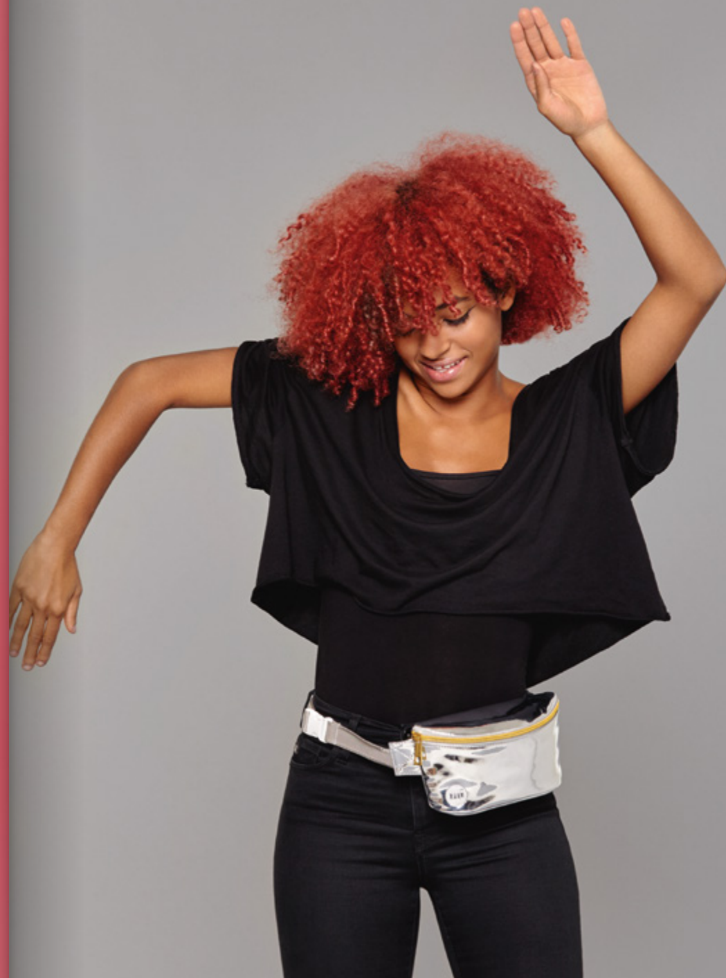
MIRROR SILVER SLIM BUM BAG 63