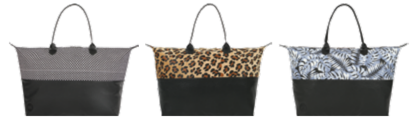
50/50 MICRODOT TUMBLED BLACK / WHITE 742350-029