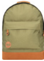
CLASSIC KHAKI NEW 740001-A19