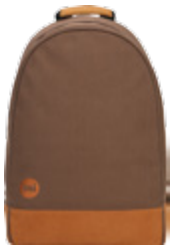
CANVAS DARK BROWN NEW 740870-004