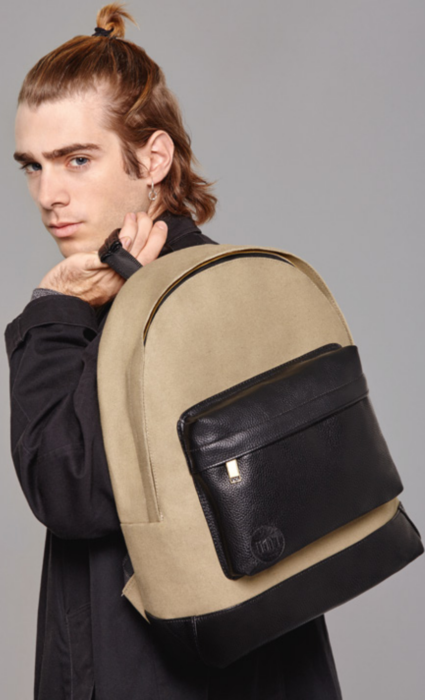
CANVAS TUMBLED KHAKI / BLACK BACKPACK 52