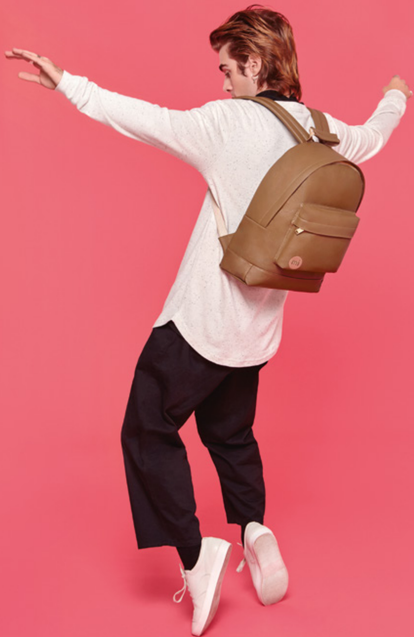
TUMBLD KHAKEI BACKPACK 62