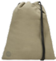
CANVAS KHAKI NEW 740554-015