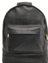
PYTHON BLACK 740317-A01