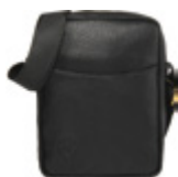
TUMBLED BLACK 742550-001