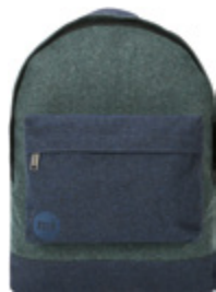
HERRINGBONE MIX GREEN / NAVY NEW 740338-043