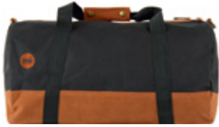
CLASSIC BLACK 740601-001