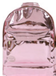
MIRROR PINK NEW 740360-047