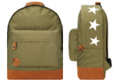
TOPSTARS KHAKI NEW 740319-105