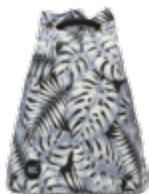
TROPICAL LEAF KHAKE NEW 740460-012