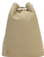
CANVAS SAND NEW 740460-014