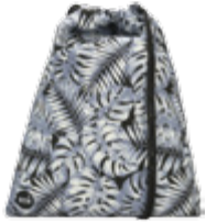
TROPICAL LEAF GREY NEW 740554-016