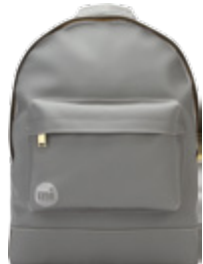
RUBBER GREY 740360-034