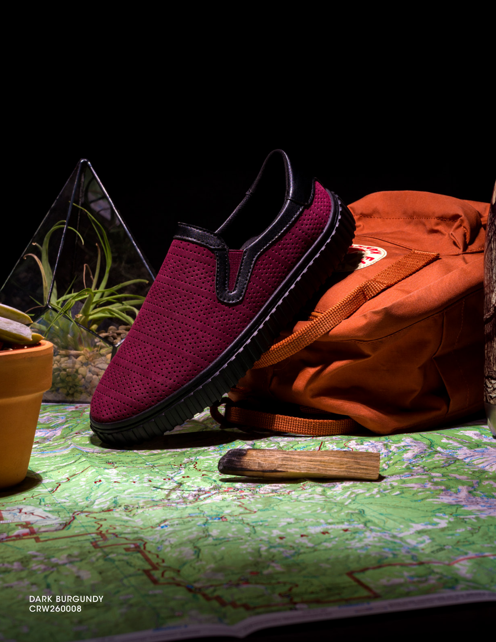
DARK BURGUNDY CRW260008