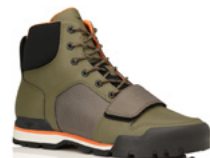
BLACK MILITARY FLAME