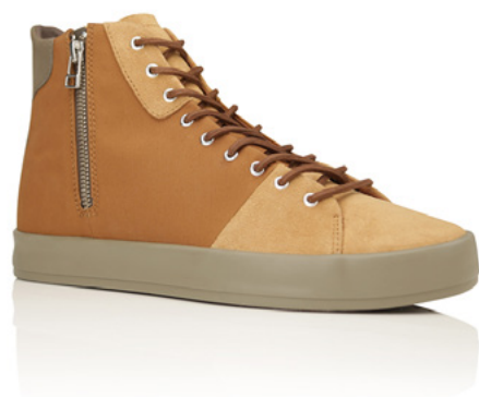
CAMEL ASH CR0660008

The Carda Hi is a classic high top suited for easy wear brought about by the lateral and medial side-zip details. Set in clean, monochromatic tones, the Carda Hi is set on a vulcanized outsole and designed with minimal paneling and branding. The hightop brings together contrasting textures for a unified, luxurious aesthetic.