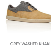
GREY WASHED KHAKI