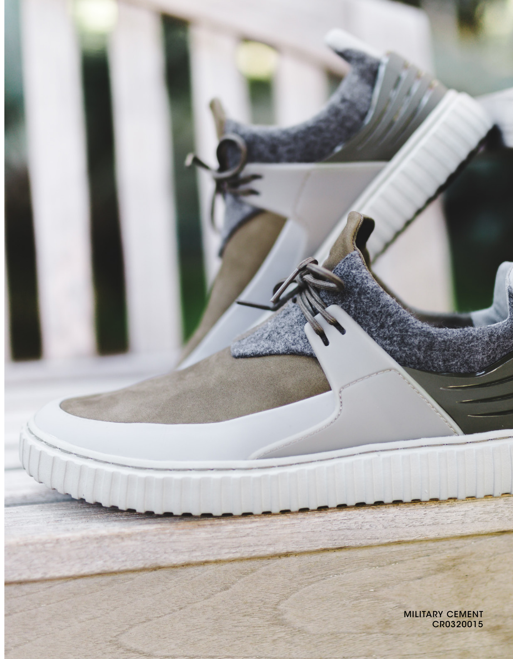
MILITARY CEMENT CR0320015

Bringing together technical components and lustrous leathers, the Castucci is a casual-sport hybrid set on a lightweight EVA creeper-inspired bottom. The low-profile Castucci is finished with a TPU cage and matte eyestays that showcase its wearable, innovative accents.