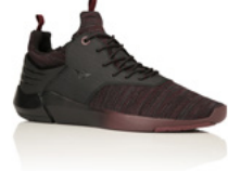
DARK BURGUNDY BLACK