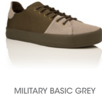
MILITARY BASIC GREY