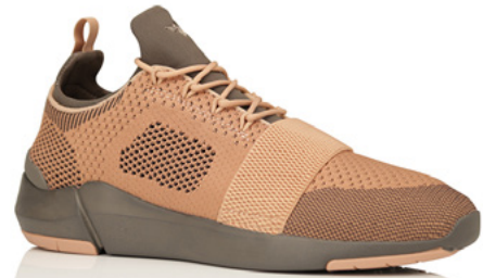
NUDE GUNMETAL CR0470022