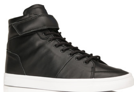
BLACK LEATHER CRW710004