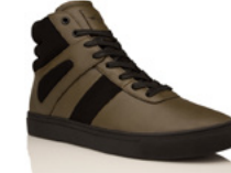
DARK MILITARY BLACK