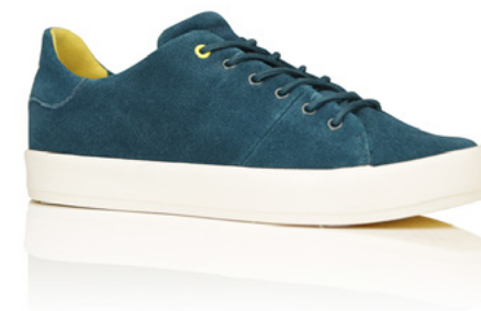
DEEP TEAL CRW670014