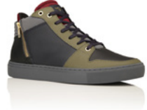
MILITARY NAVY BLACK