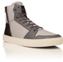
BASIC GREY SMOKE