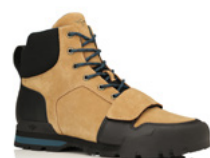
BROWN BLACK TEAL