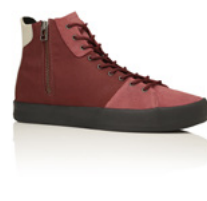
DARK BURGUNDY BLACK