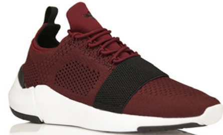
DARK BURGUNDY CRW470008