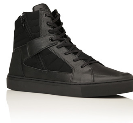
BLACK BLACK CR0830001