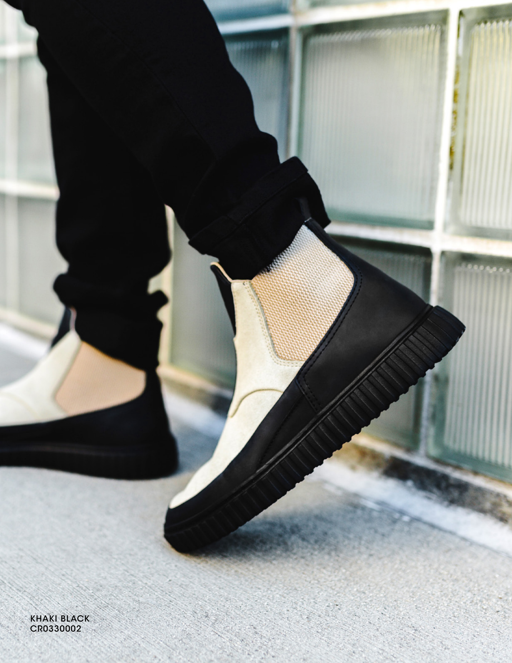
KHAKI BLACK CR0330002