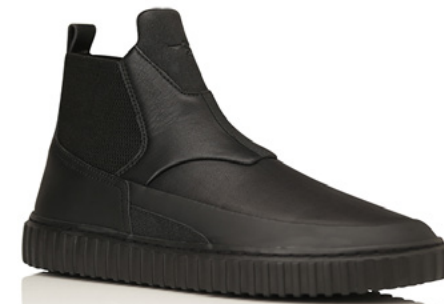
BLACK BLACK CR0330001