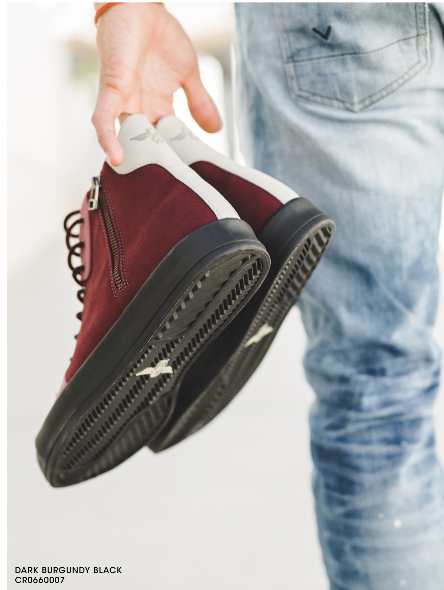
DARK BURGUNDY BLACK CR0660007

The Carda Hi is a classic high top suited for easy wear brought about by the lateral and medial side-zip details. Set in clean, monochromatic tones, the Carda Hi is set on a vulcanized outsole and designed with minimal paneling and branding. The hightop brings together contrasting textures for a unified, luxurious aesthetic.