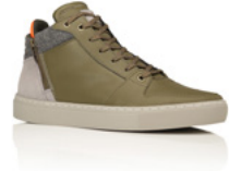
MILITARY BASIC GREY