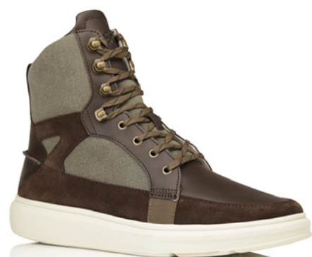
DEMITASSE ASH CR0810002

The Desimo was designed with the city dweller in mind and is the evolution of a winterized sneakerboot. It is set on a rubber wedge cupsole, materialized in clean leathers and outdoor-inspired textiles. Classic boot components like round two-tone laces and speed eyelets finish the look.