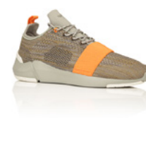
CEMENT MILITARY ORANGE