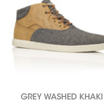
GREY WASHED KHAKI