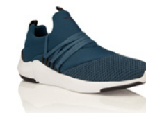
DEEP TEAL BLACK