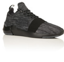
BLACK SMOKE VAPOR