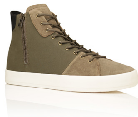
MILITARY VINTAGE CR0660006