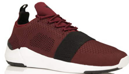
DARK BURGUNDY CR0470023