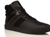
BLACK BLACK PATENT