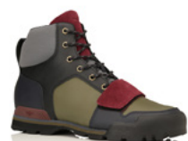
MILITARY NAVY BURGUNDY