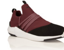
DARK BURGUNDY BLACK