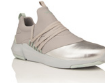
VAPOR SILVER ICE