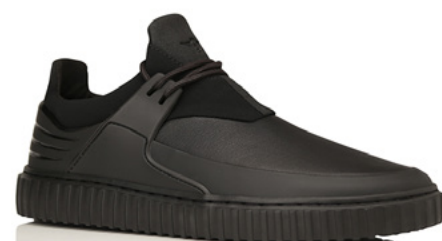
BLACK BLACK CR0320013