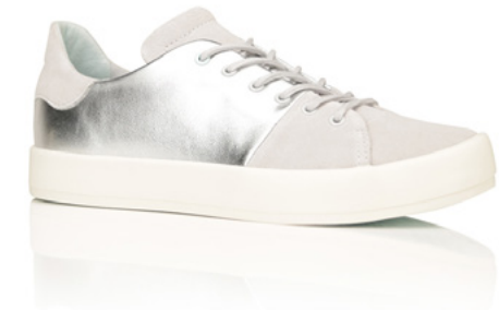
VAPOR ICE CRW670015

The Carda is an everyday classic that integrates clean lines, minimal branding and contrasting materials for a contemporary blend of style and ease. The classic tennis shoe includes an exaggerated heel and square laces for modern detailing, and is set on a vulcanized outsole to provide a relaxed and stylish vibe for the season.