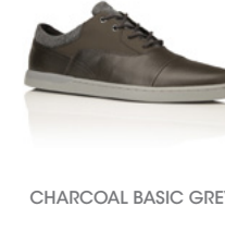
CHARCOAL BASIC GREY