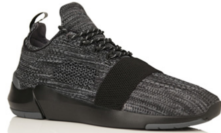
BLACK SMOKE VAPOR CR0470015