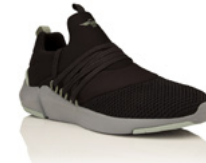
BLACK GREY SAGE