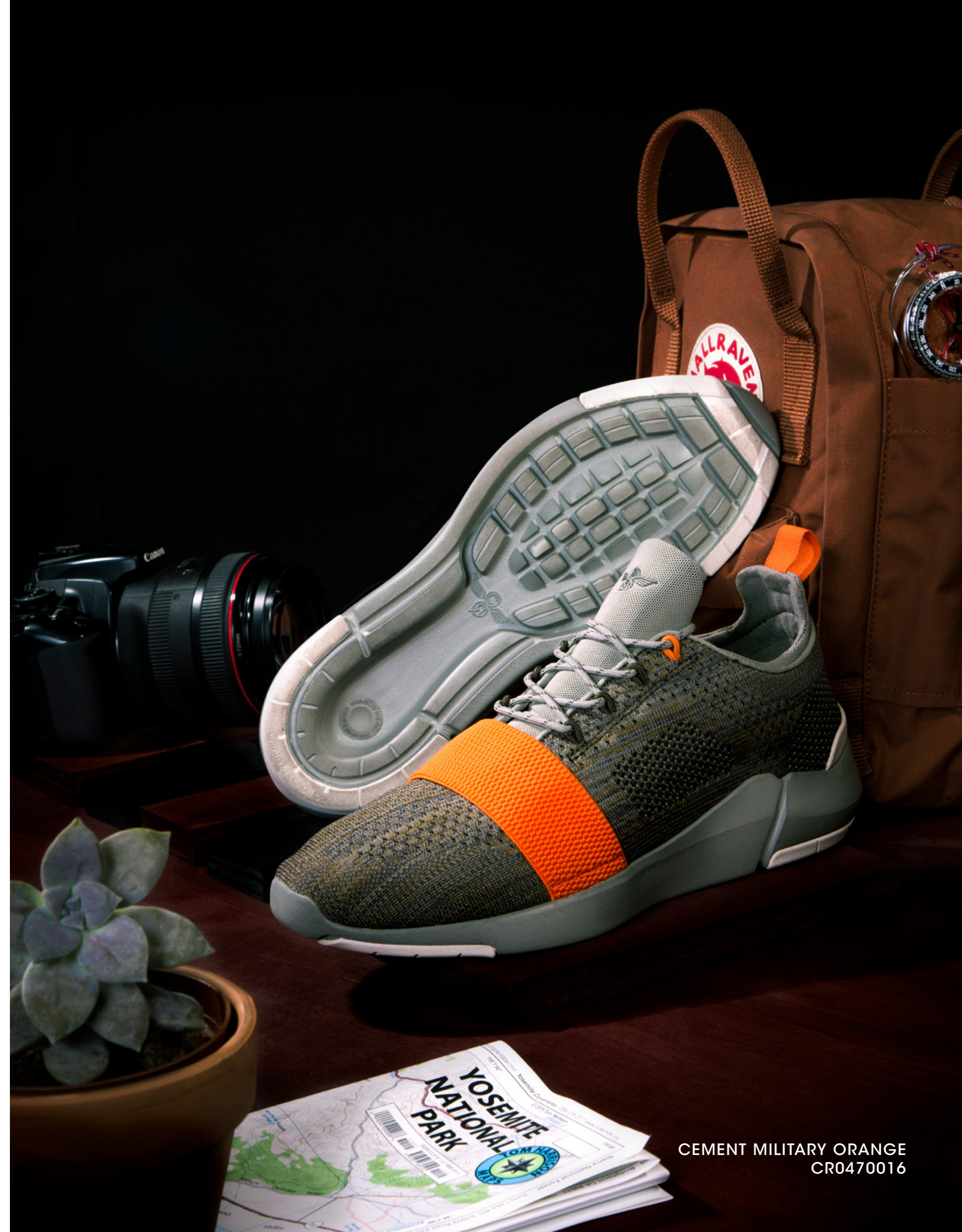
CEMENT MILITARY ORANGE CR0470016

The Ceroni is a low top runner with an engineered knitted upper combined with a neoprene bootie. Inspired by a life on-the-go, the Ceroni is constructed with stretchable, slip-on flexibility and rear pull-tab accents. It is set on a lightweight EVA outsole featuring rubber pods to prevent abrasions on the sole and is finished with a front elastic strap for a seamless, athletic design.